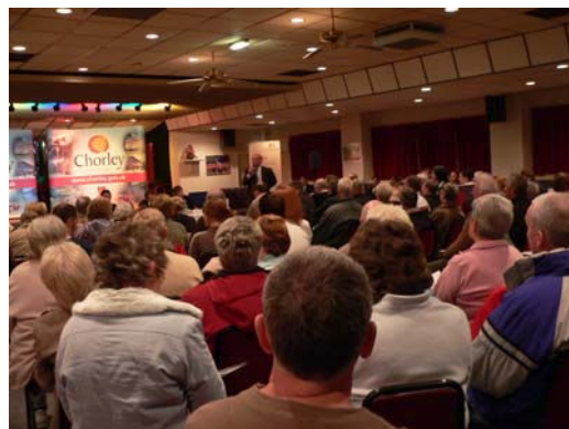
Area Forum pilots attracted large numbers to meetings

Three fairly small areas were recently selected to benefit from Area Forums run on a pilot basis. These consisted of public meetings of committees made up of councillors elected from within the area, plus co-opted members representing partner agencies. They provided an opportunity for the public to raise issues, hold public services accountable and receive a response to questions raised; and for service providers to report on plans, concerns and prospects. This experience is currently being evaluated. The experience is felt to have shown value in making service