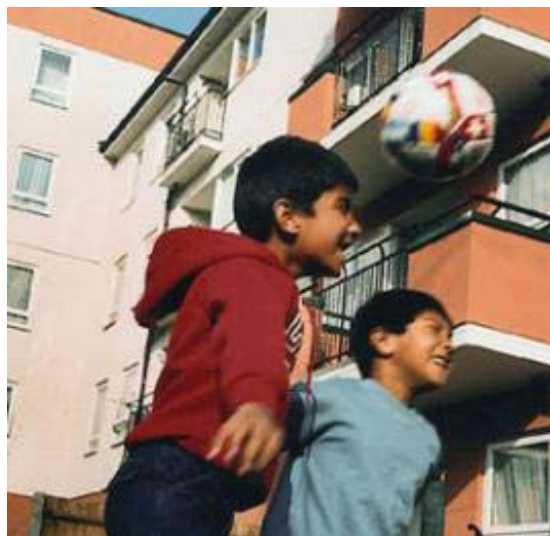
Poplar HARCA: A 'guide neighbourhood' anchoring the management of over 5000 homes and services to 46000 people

The term 'community anchor' refers to the idea that a strong, independent community organisation may have both management capacity and democratic legitimacy. Its core activity may be (for example) housing, leisure or community centre management. However this capacity can be transferred beyond the core activity to support a range of neighbourhood services, either directly provided by the organisation itself or provided by partners associating themselves with this 'anchoring' capacity. Community anchors may start out as resident-led housing providers, development trusts, faith groups etc, but grow beyond this core mission to become more comprehensive neighbourhood service organisations, with extensive professional staffing, while retaining their community base and accountability.