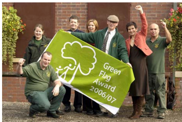
Environmental betterment: one foundation for neighbourhood working

The council's Environment Streetscene and Neighbourhoods directorate is committed to developing neighbourhood working, especially to align its work with community priorities in carrying out cleansing and the maintenance of public space, and to promote public satisfaction with services. The directorate has experience of managing neighbourhood wardens. If these are phased out, additional Police Community Support Officers (PCSOs) will to some extent replace the warden service operating within the police