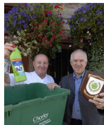
Environment and streetscene: one ‘day job’ already promoting neighbourhood working

There is a wider range of services whose involvement should be considered in the light of wider strategic aims. These include older persons’ services (social services and