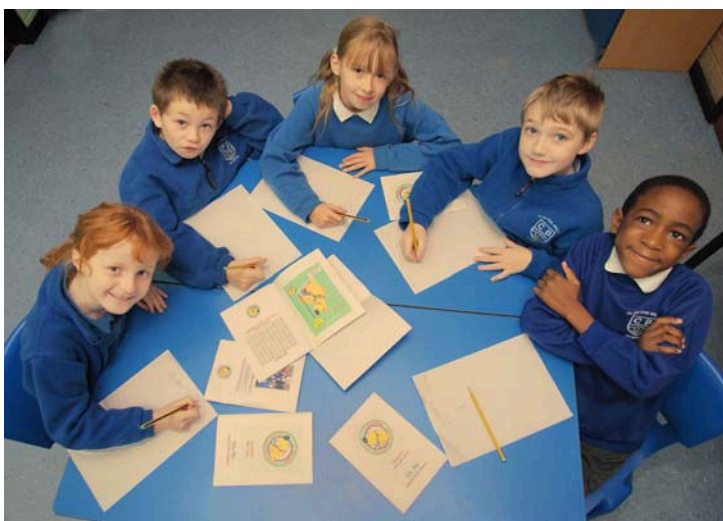
Junior wardens: Neighbourhood working in Chorley is already building tomorrow's active citizens

Typically, neighbourhood working means winning the co-operation of a range of service providers including police and related community safety teams, environmental and streetscene services, highways, social housing managers, youth and leisure services, education providers, health and possibly social services. The approach is intended to co-ordinate ('join-up') resources and service delivery to ensure that those problems often seen as most affecting quality of life in a neighbourhood – for example poorly managed and maintained open space, anti social behaviour, minor disorder and damage – are addressed by bringing the activities of a range of