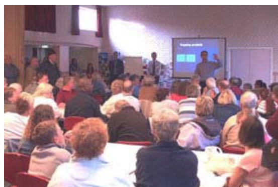
A community committee meeting in Salford